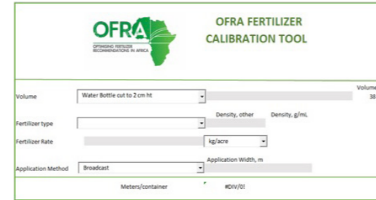
A fertilizer calibration tool is used to convert the recommendation, expressed as kg of fertilizer per hectare of land, to a more farmer-friendly measure.

Based on the information provided, the calibration tool provides a user-friendly fertilizer recommendation; for example, instead of 40 kg DAP per hectare it might suggest a plastic water bottle lid full of DAP applied as a band 2.1 meters long.